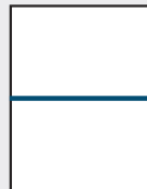
7.5 x 5 inches