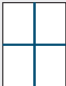
3.75 x 5 inches