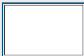
17 x 11 inches with .25 inch bleed

$100/hr ad design fee for any designed or resized ads