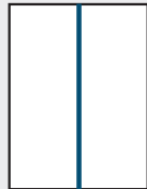
3.75 x 10 inches